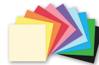
Matt Paper Squares