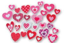
Foam Heart Stickers