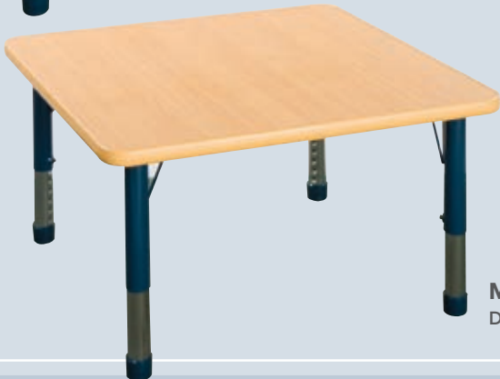
Milan – Square Table DM805 90cm square $269.95

Aurora Tables Aurora tables feature metal, height adjustable legs and a durable melamine surface. Tables can be adjusted from 39cm up to 62cm high. Suitable for early primary school.