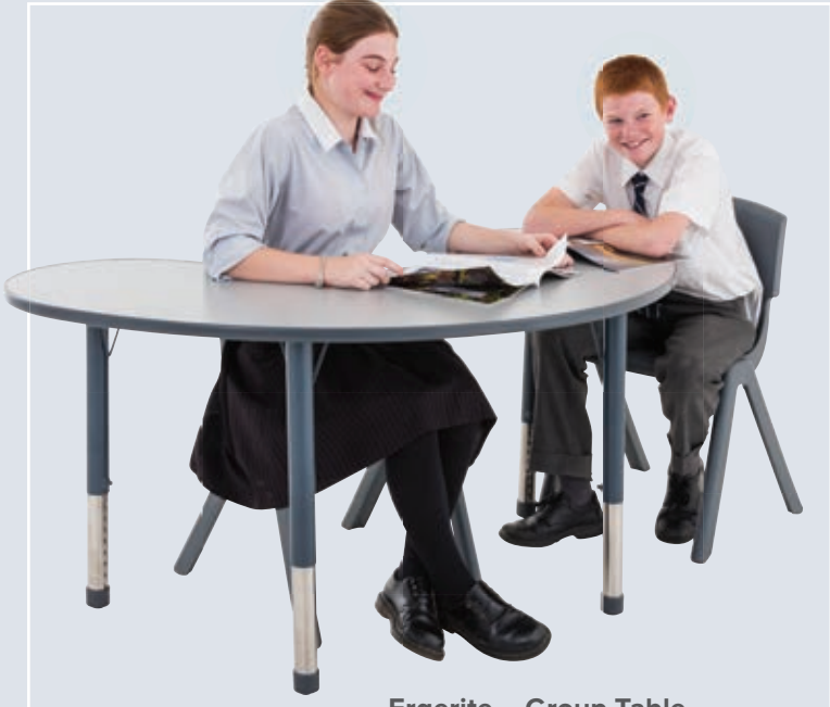
Ergerite – Group Table HS070 154cm $249.95