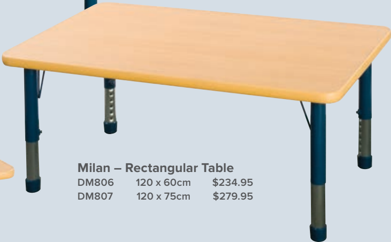
Milan – Rectangular Table DM806 120 x 60cm $234.95 DM807 120 x 75cm $279.95