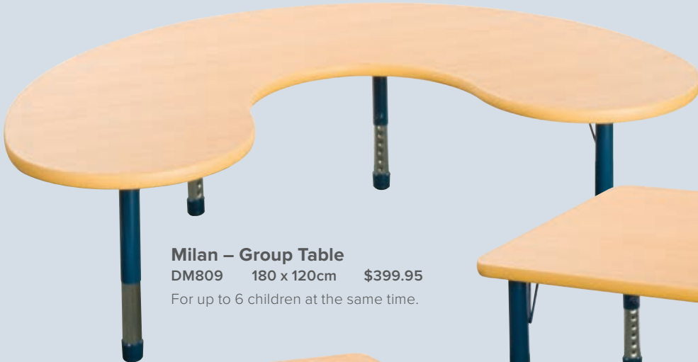
Milan – Group Table DM809 180 x 120cm $399.95 For up to 6 children at the same time.