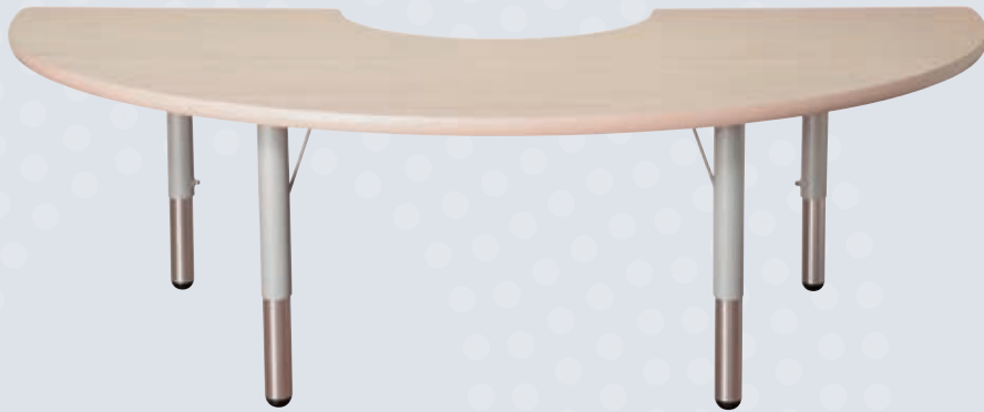
Natural Spaces – Group Table DM4009 180 x 90cm $399.95

Natural Spaces tables feature metal, height adjustable legs and a durable melamine surface. Most tables can be adjusted from 39cm up to 62cm high. Suitable for early primary school.