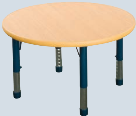
Milan – Round Table DM808 90cm diameter $299.95

Milan Tables Milan tables feature metal, height adjustable legs and a durable melamine surface. Tables can be adjusted from 39cm up to 62cm high. Suitable for early primary school.