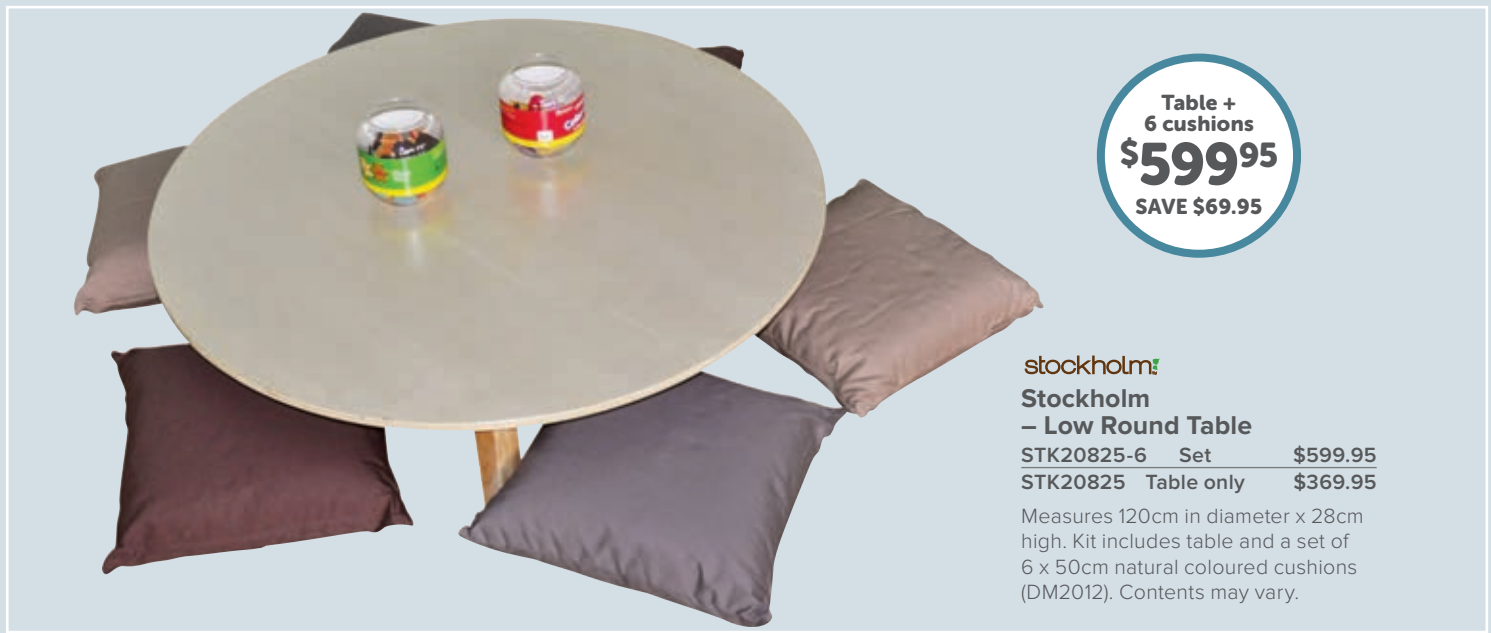
Table + 6 cushions $599 95 SAVE $69.95