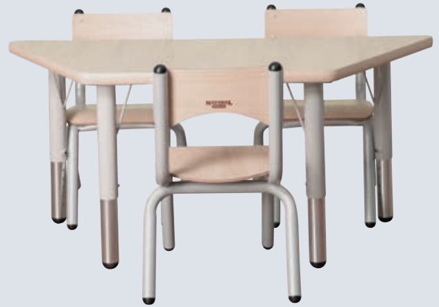
Natural Spaces – Trapezoidal Table DM4007 120 x 60cm $239.95