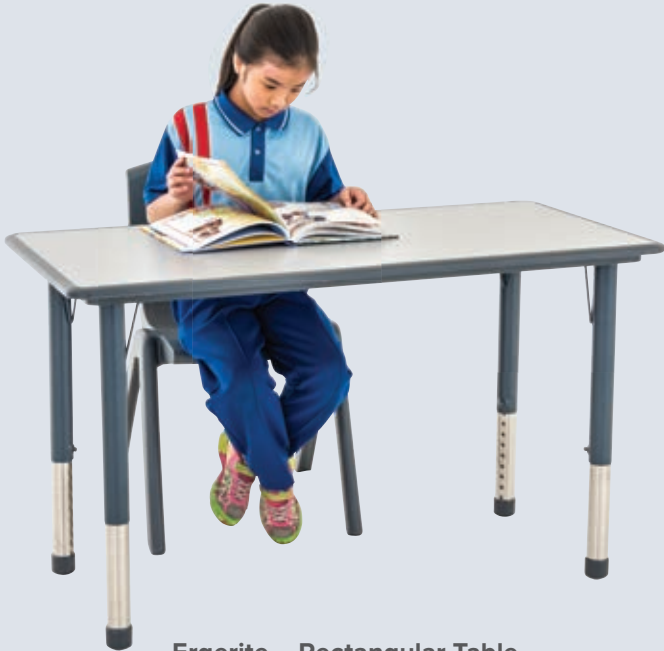
Ergerite – Rectangular Table HS061 120 x 60cm $169.95

These lightweight and robust tables are perfect for the library, primary school or high school classrooms. The table tops are made from a fire retardant particle board, and are coated with a high quality, grey laminate. The high quality, moulded edge adds extra durability and strength. The legs feature a rubber base to help prevent scratching and can be adjusted to stabilise the table. The legs are easy to assemble and can be adjusted in height from 52 - 75cm. These tables are suitable for use in classrooms from early primary through to high school, and can be used with chairs with a seat height of 30cm - 46cm.