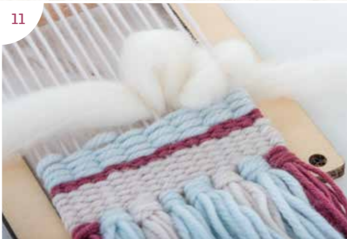
11 When adding the wool roving, weave using your hands instead of the needle and loosen each weave to make it bubble out. You can use the full width of the wool roving provided or separate it into thinner strips.