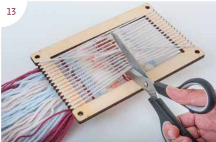
13 Turn the loom over and cut along the middle of the back vertical rows.