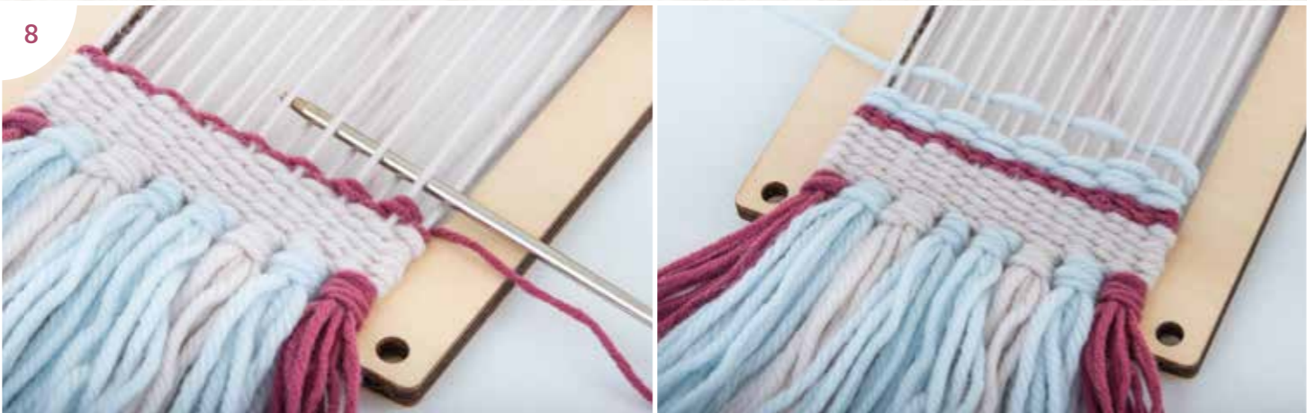
8 You can weave by threading the wool under one vertical row then back over the next vertical row or over and under 2 rows at a time to create a different texture.