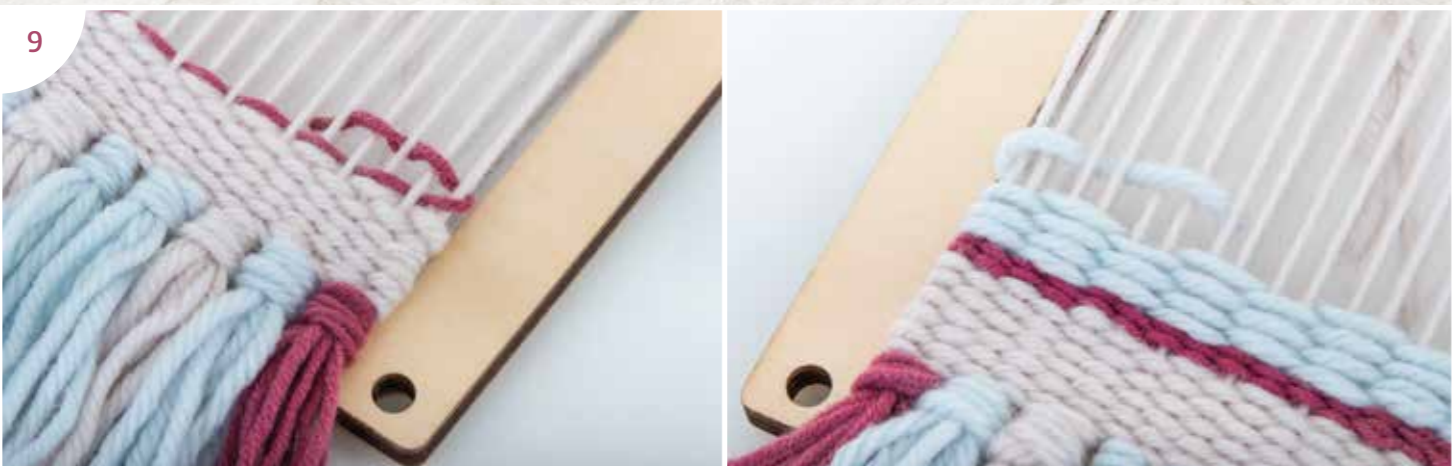
9 For each length of wool you weave onto the loom, leave a small length of wool on either side that you can tuck in.