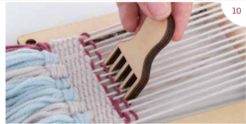
10 After each row you weave, use the wooden comb to push the wool down the vertical rows to lay flat along the previous row.