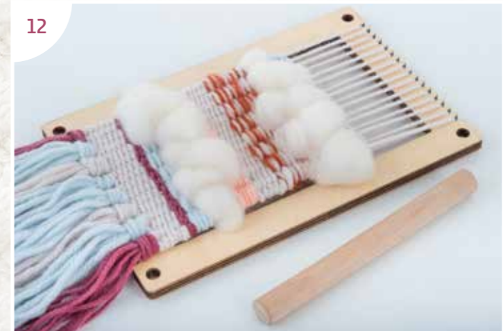
12 Once your weaving is close to the top of the loom, remove the wooden dowel.