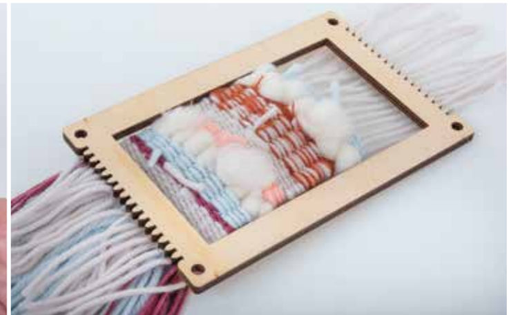
14 Tie off each pair of strings in a double knot as close to the weave as possible. Do this along the bottom and the top. This will prevent your weaving from falling apart.