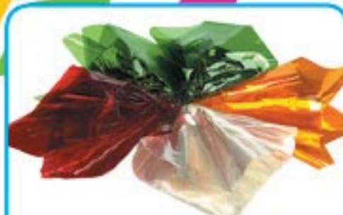
Coloured Cellophane ME59 (20 pieces) $19.90