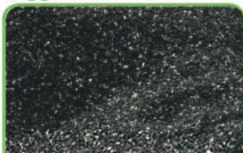
Black Quartz Sand PNP040 (1 litre jar) $13.90