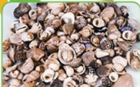
Mini Shells PNP029 (700gram) $9.90