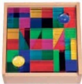
Luminescent Building Colour DY103325 (98 pieces) $399.90