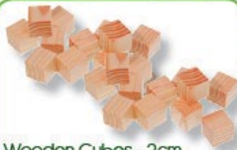
Wooden Cubes – 2cm DC463 (100 pieces) $21.90 5 or more $19.90