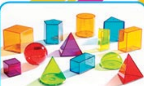
Geometric Solids LER4331 (14 pieces) $29.90