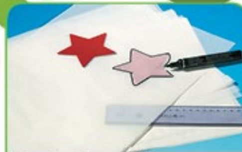
Tracing Paper A3 MD1016 (25 sheets) $8.90