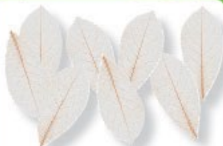
Natural Skeleton Leaves TH001 (100 pieces) $9.90