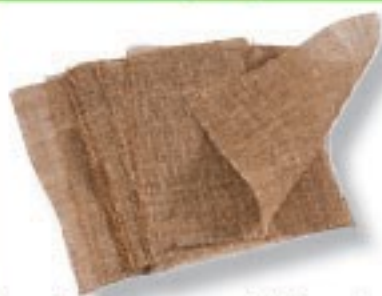
Hessian Squares Natural SH892 (10 pieces) $7.90