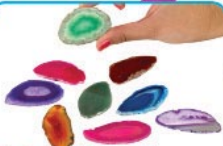
Agate Light Table Slices KAP8610 (12 pieces) $49.90