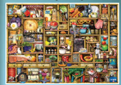
19107, The Kitchen Cupboard 1000 piece (No 1 in the Curious Cupboard series)

Also by Colin Thompson in the Ravensburger range: