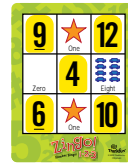
"X Marks the Spot"